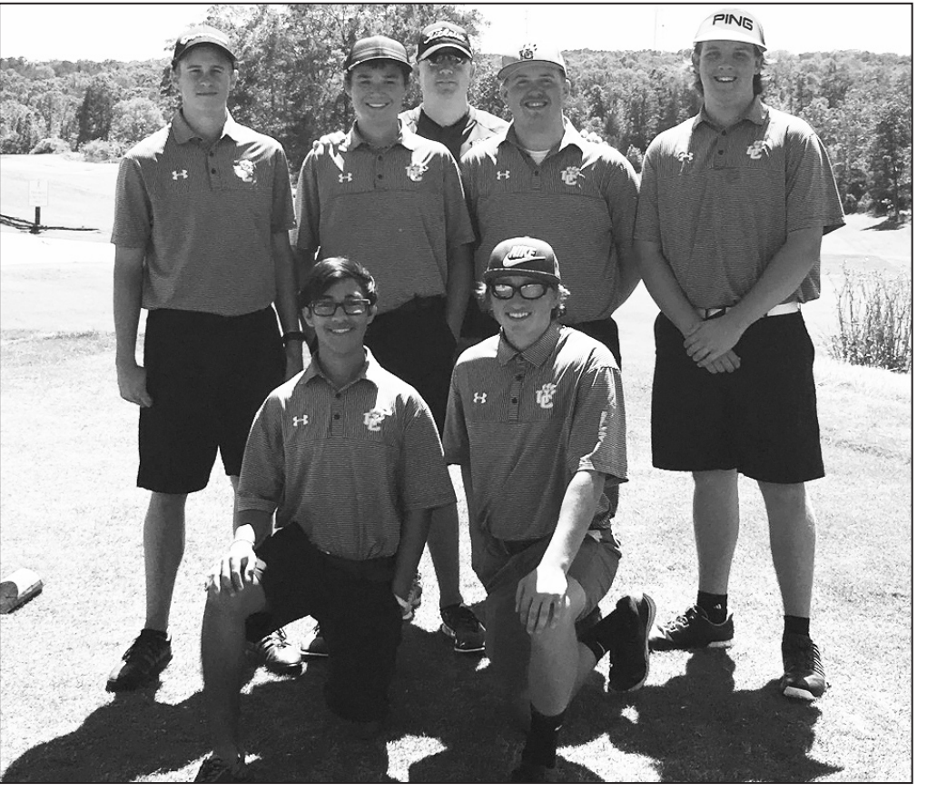
The Union County boys golf team shot a 351 to place sixth at the Area Tournament last Monday. In order for the team to qualify for state, they needed to finish in the top four or shoot under 340

Host team Hart County took home the top spot in Area with a score of 303. They also claimed the individual title with